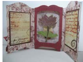
Shadow Box die cut sample by Debbie West.